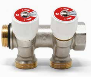
Manifold with 2 outlets